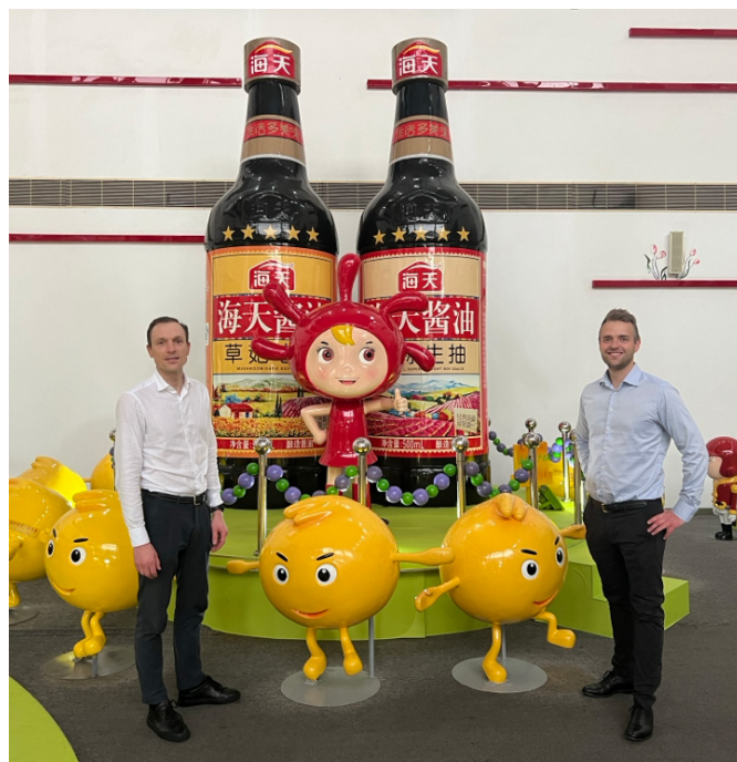
Touring a soy sauce brewing facility of leading Chinese consumer company, Foshan Haitian.

The property sector remains one area of the economy that has yet to show a meaningful improvement. Sales, housing starts and completions have underwhelmed, and the government's latest policy initiatives, to boost public sector housing construction and channel more financing to real estate projects, have yet to bear fruit in terms of demand.