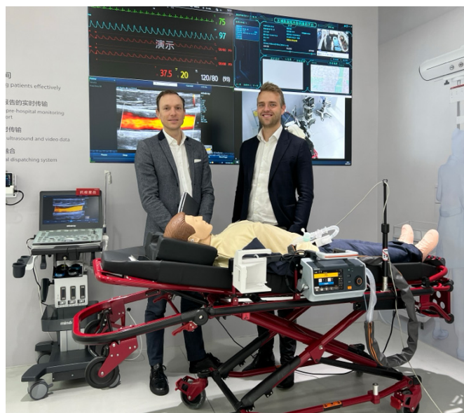
Touring the facilities of Shenzhen Mindray, a patient monitoring and medical equipment manufacturer.

One area of outperformance in the Chinese market in the last two years has been global exporters. Whilst property has been in crisis and consumption weak, exports have been very strong. China has several world class high-tech companies that are globally competitive, and this competitiveness has increased of late, as the Chinese renminbi has weakened against the US dollar and deflation has put downward pressure on prices. We conducted a tour of one such company that has performed relatively well in the recent downturn, Shenzhen Mindray. The company manufactures patient monitoring, imaging and in-vitro equipment for hospitals, and it informed us that 40% of its sales are now generated from overseas. It continues to take global market share by offering healthcare systems, especially in other EM countries, and these critical devices are priced lower than western multinational competitors.